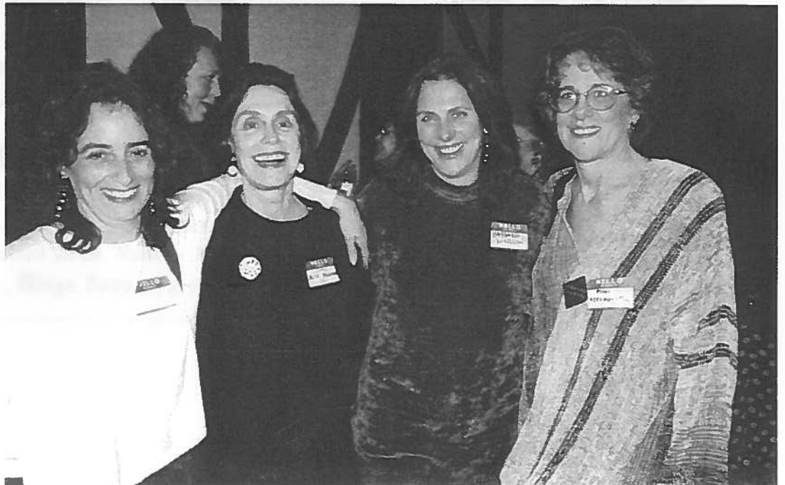
WLM event 12-13-97 New York