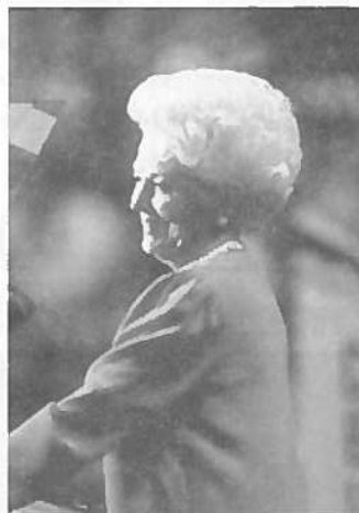
Former Texas Governor Ann Richards Gone Too Soon! (1933- 2006)