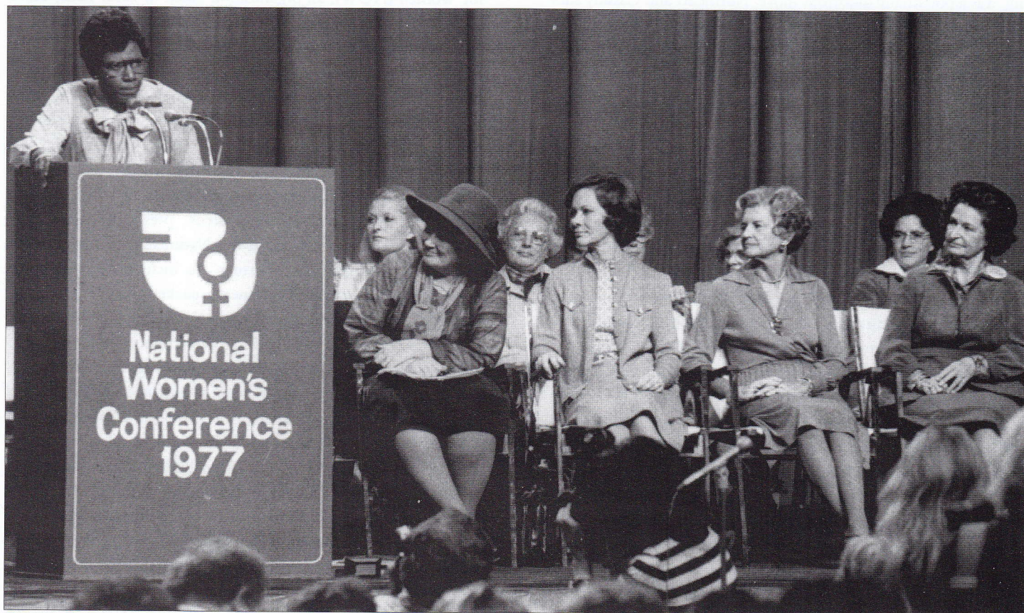
Barbara Jordan speaks at the National Women's Conference, with dignitaries looking on. (front row, l-r) Bella Abzug, Rosalind Carter, Betty Ford, Lady Bird Johnson.